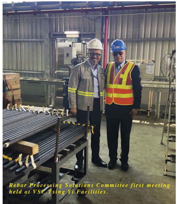
Rebar Processing Solutions Committee first meeting held at VSC Tsing Yi Facilities.

For the very first time, HKCMA is going to organize the industry wide Sustainability, Health Safety awards across the core product spectrum. Underlying spirit of this excellence award is to inculcate health safety and promulgate best trade practice sharing for overall well-being and innovation of HK construction material industry.